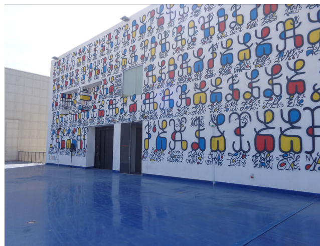
Figure 2 'Panorama'-Tower, Friche de la Belle-de-Mai Art Factory, Perimeter Euroméditerranée

A further dimension in the metropolitan development of the Marseille region was the year-long event MP2013, following Marseille's designation as European Capital of Culture in 2008. During the years preceding its selection, Marseille scarcely seemed suitably qualified or equipped for such