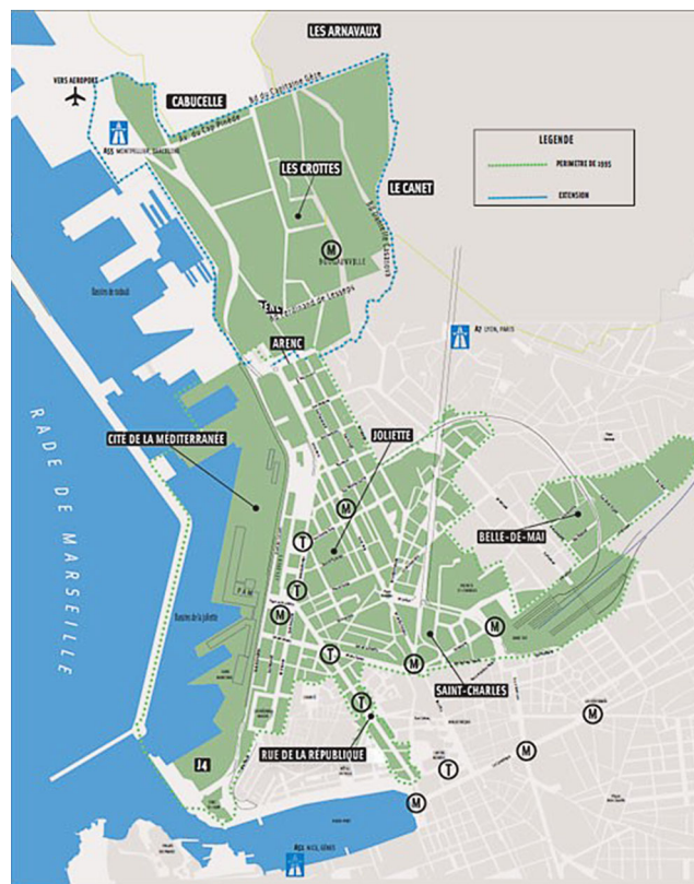
Figure 1 Perimeter of the Operation of National Interest Euroméditerranée in the centre of Marseille – in green on the map (Scale: 1cm: 300 m)

On the political level and in terms of identity, however, this budding metropolis is not just complex but also a continuing source of conflict, teaming with ruptures and entrenched rivalries. Hence, “Marseille, the impossible city” (Viard 1995) or the “unfinished metropolis” (Club d’échanges et de réflexions sur l’aire métropolitaine marseillaise 1994; Chouraqui/Langevin 2000) remain topical to this day. Nonetheless, a process of metropolitan construction has recently begun, based upon certain ‘metropolitan catalysts’ that we now introduce. Three factors have decisively shaped Marseille’s metropolisation processes over the last two decades: Euroméditerranée , the European Cap-